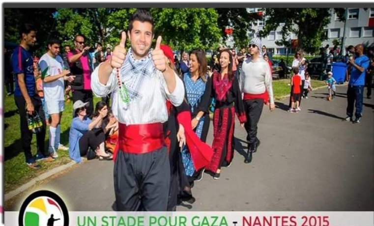
UN STADE POUR GAZA - NANTES 2015