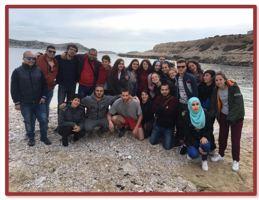
Figure 10 : The group of the exchange near Marseille and in front of the Mediterranean sea.

In November, HSA hosted a French group from Paris and Marseille for the youth exchange Carte Blanche during 2 weeks. So we made the same thing in March. Our volunteers from the first exchange in Palestine went to Marseille to meet the same French group. They enjoyed a lot to discuss about free expression, French culture and to discover this country.